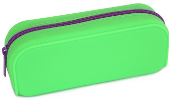
One pencil case