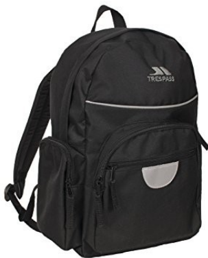
One school bag (capable of carrying A4 folder)